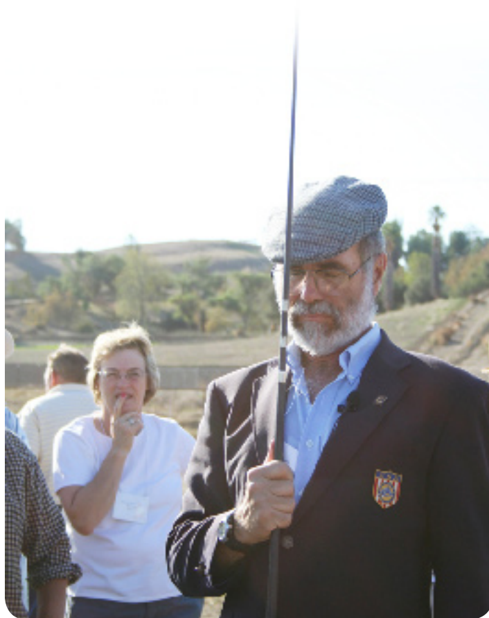
Hardy Performs a perfect salute for the crowd at the ADS Annual meeting.

"I drove her every step of the way, asking asking asking, adjusting adjusting adjusting (it felt like nagging nagging nagging). As we were taking a walk around the perimeter at the end of the workout, on a fairly long rein but still watching every step, a deer dashed out so fast that even I got something of a shock. In the past this horse would have done a 180, but she was totally in my hands and focused on ME. Maybe you can use this in a column sometime. Dressage is not only for performance improvement, it can save your life!"