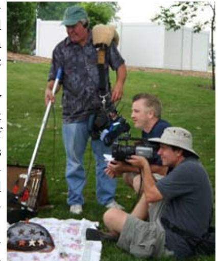
The Food Network film crew

Once the official air date is set, we'll let you know!