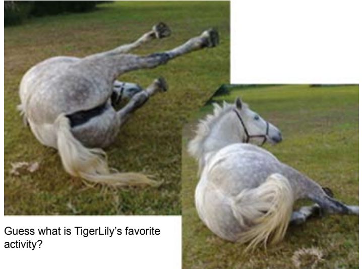
Guess what is TigerLily's favorite activity?

If you are mainly driving for pleasure, then your considerations are different than if you plan to show. I too started with a Meadowbrook because it was cool looking (and it came with my horse). But since I like to drive in fields and off-road, I got a little spooked about the safety—worried about a wheel coming off if I hit a hole, or having to get out in a hurry (and of course trying to get people safely in and