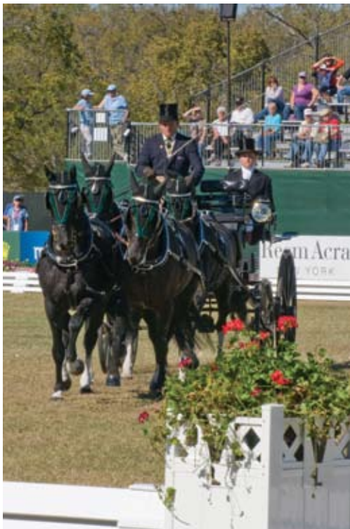
Boyd Exell driving the Dressage phase at the 2010 World Equestrian Games (Lexington, Kentucky), where he won the individual gold medal.

April 1 – At an early-season CDE, a deer runs out in front of the first turnout on course. The pony pops, the navigator “exits” and lands in an ants’ nest. The driver summons help. Thanks to that flashy armband right there where it should be, emergency services deliver quick and proper care to the unfortunate navigator whose armband says she’s allergic to ants. You have made a real difference in the real world.