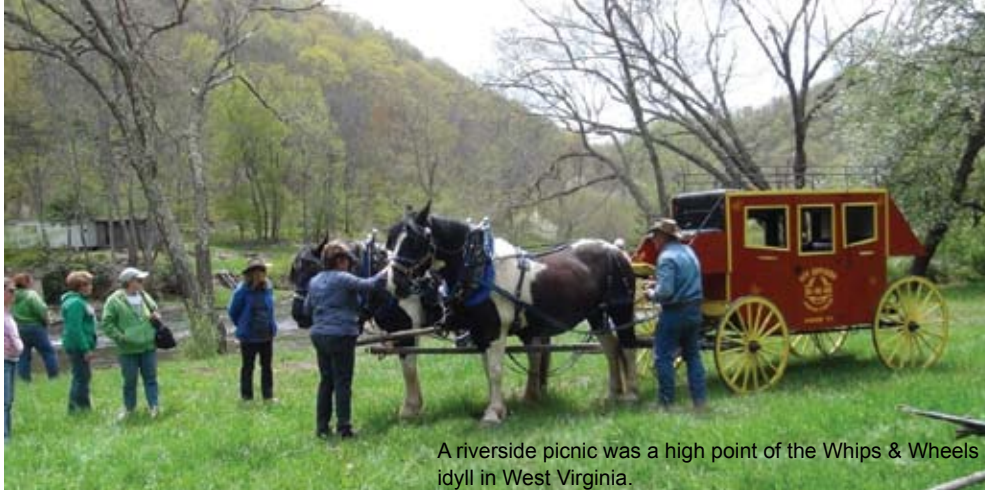
A riverside picnic was a high point of the Whips & Wheels idyll in West Virginia.