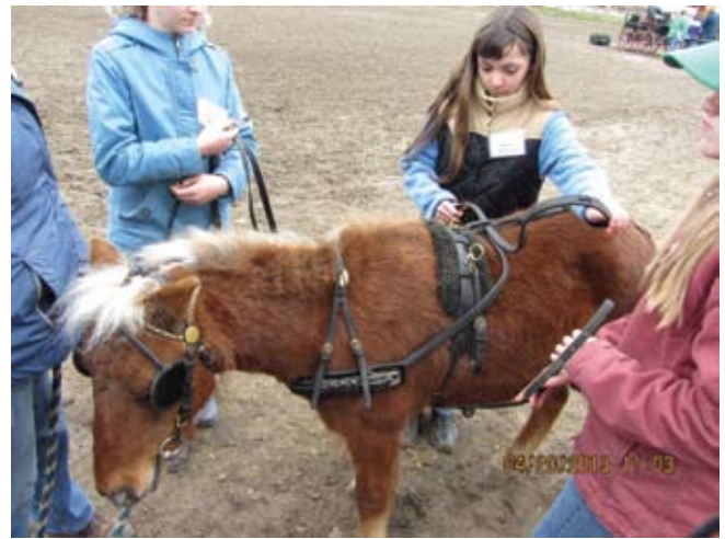
(Above) One of the younger participants puts the harness on the miniature horse.