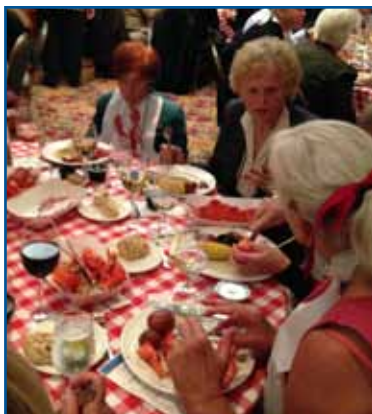
Saturday evening included a traditional Maine Lobster Bake. Even the most refined of guests donned plastic “bibs” for the night!