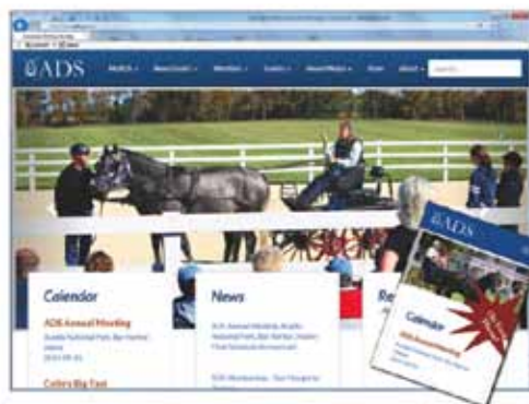
A screen shot of the new ADS website.

We realize that this will be an insignificant change for some and substantial for others. Please know that the ADS staff will do everything in our power to make this change as easy as possible for everyone. Thank You!