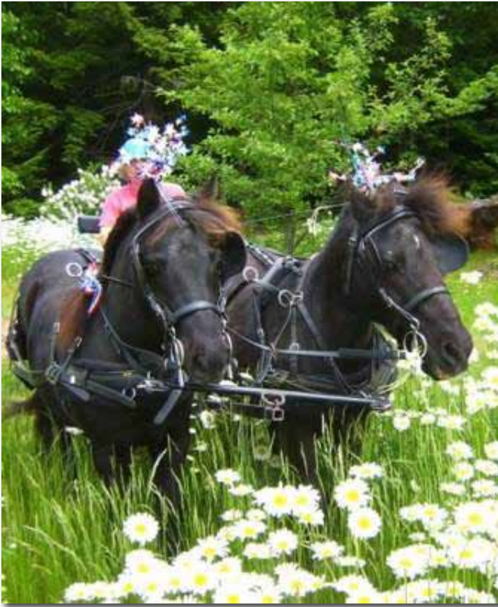
Barnum & Bailey.