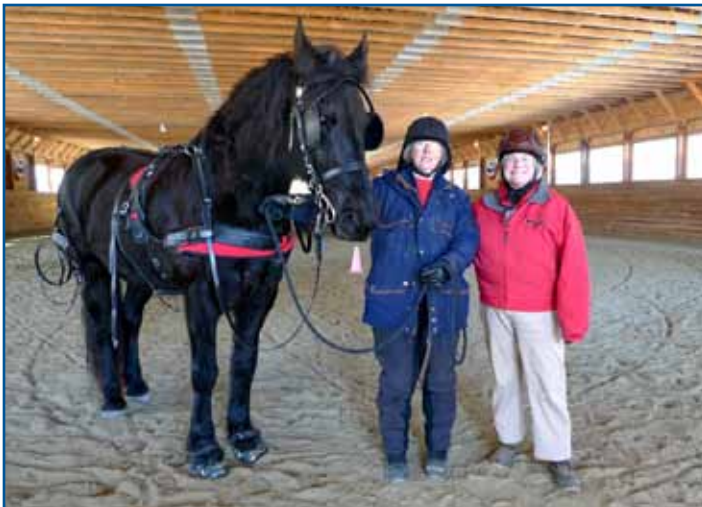
Individual instruction from Boo