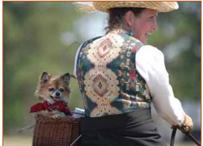
Sable was never defeated in the Carriage Dog Class! She is pictured at the Carriage Classic in the Pines, Pinehurst NC