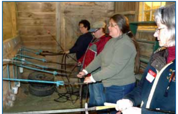
Rein board practice