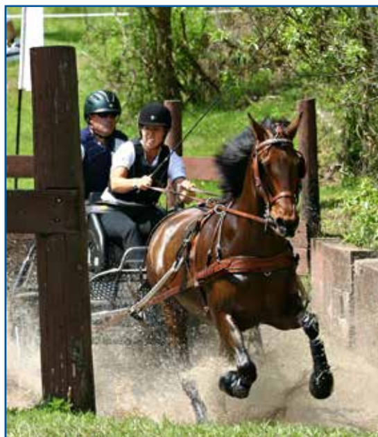
PVF Peace of Mind (Statesman Signature x JPR Have Mercy/Saddleback Sky Pilot) 2007 Morgan mare

Articles that appear in the Wheelhorse do not necessarily reflect the opinions or position of The American Driving Society, its Board of Directors or staff, nor does publication of said articles constitute an endorsement of the view they may express. Accuracy of all material is the sole responsibility of the authors. Appearance of an advertisement in the Wheelhorse does not constitute an endorsement or recommendation by the American Driving Society of the goods and services therein.