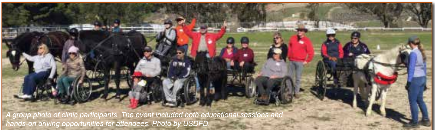
A group photo of clinic participants. The event included both educational sessions and hands-on driving opportunities for attendees.